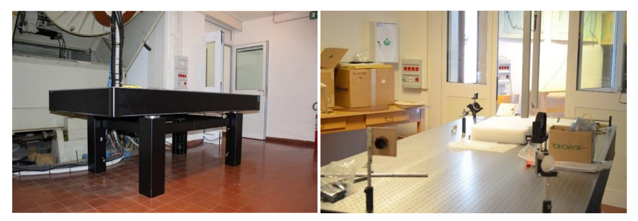
Figure 3. A view of the laboratory at the Coudé focal station of the Copernico Telescope as it has been refurbished: a light tight room with new thermal isolation and electronics. An optical table has been positioned as workbench to host visiting instruments.

The dedicated area has been refurbished to create the laboratory, a room of c.a. 20m^2 hosts the laboratory where a large optical bench (2400 x 1200 mm) is placed, on which users can set up their own instruments and AO testing will be carried on. Indeed, the laboratory is enclosed in a light-tight room that can be darkened as needed; also a key requirement is to keep a stable temperature control, it is in fact also thermally insulated from the surrounding environment. In Fig. 3 pictures of the laboratory are shown. The optical axis exiting from the telescope's structure is deviated by a folding mirror (Fold 4) that redirects the beam allowing the focus to fall on the optical bench.