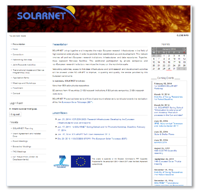
SOLARNET Website (Homepage)

The updating of the webpage is going good but it requires the contribution of all SOLARNET related people to keep the website fresh and updated.